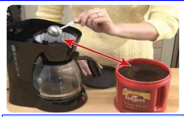
The distance it takes for me to forget a number between I and I0